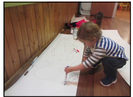
Tracing our bodies