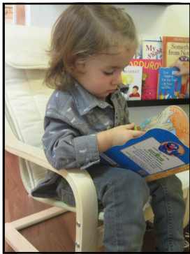
We love to Read!!