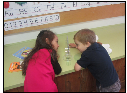
Looking at our eye color in the mirror