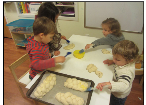
Challah Baking Time