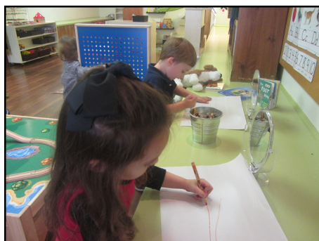
Drawing our self portraits