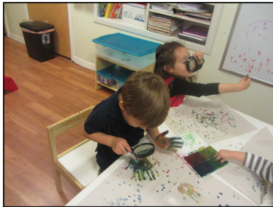
Studying our finger prints